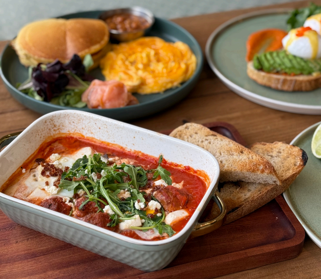
*please note that baked items required a longer cooking time, thank you for your patience